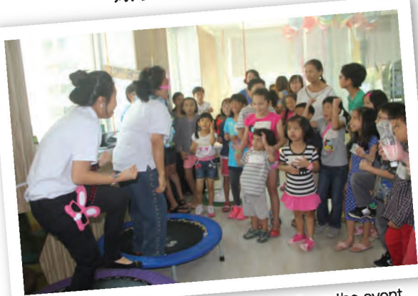
Welcoming the children and giving them the event highlights of the day. 在欢迎会上向孩子们讲解当天活动亮点。