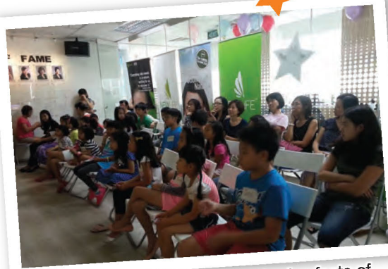
Mothers and children learning the fun facts of good nutrition. 妈妈和孩子一起学习好营养的小知识。