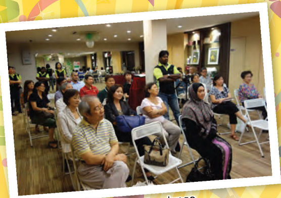
Members and staff in attendance. 会员和员工皆出席。