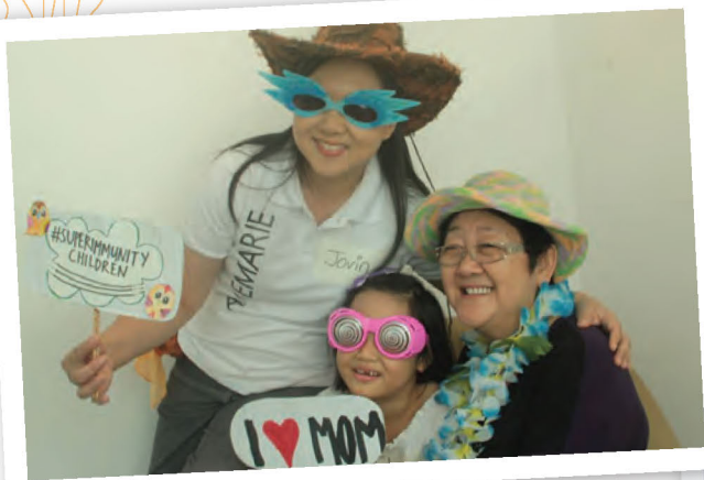
Lovely smiles from 3 generations. 三代同堂的漂亮笑颜。