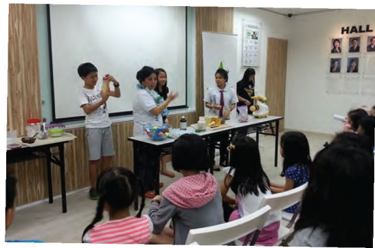
Sharing quick and easy nutritious recipes. 分享快捷又简单的营养食谱。