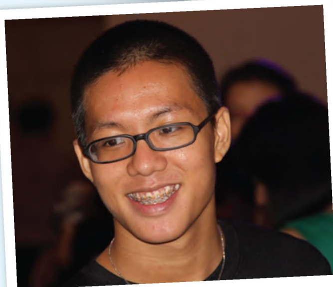
After... in 2013 之后 (2013年)