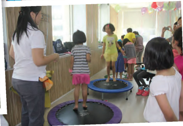
The children are having so much fun exercising on the Rebounder. 孩子们玩弹跳床玩得不亦乐乎。