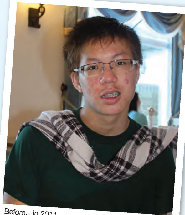
Before...in 2011 之前 (2011年)